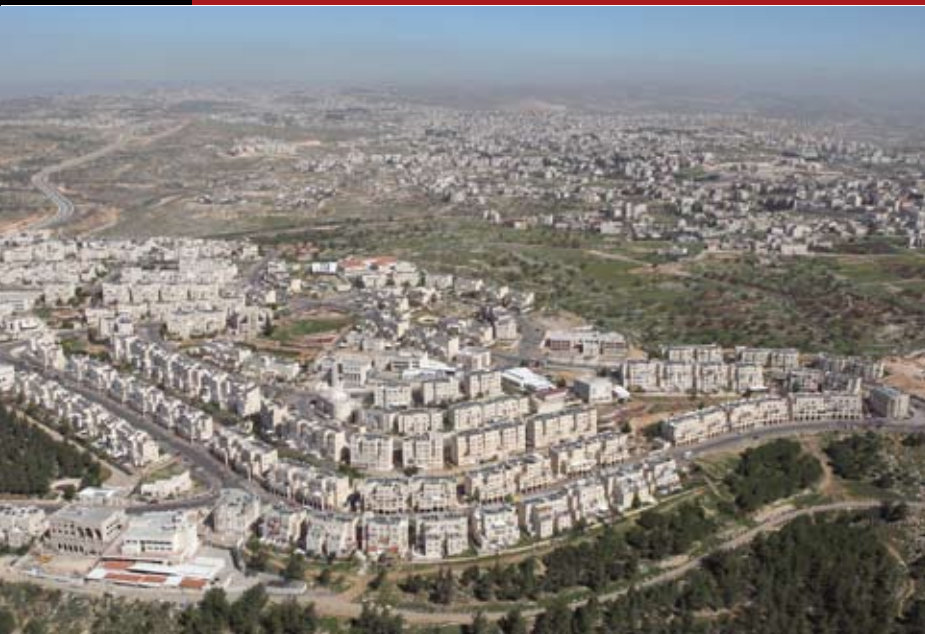
Ramat Shlomo, Israel

Plans to build 1,600 more homes in East Jerusalem prove Israel is 'Judaizing' the Holy City.