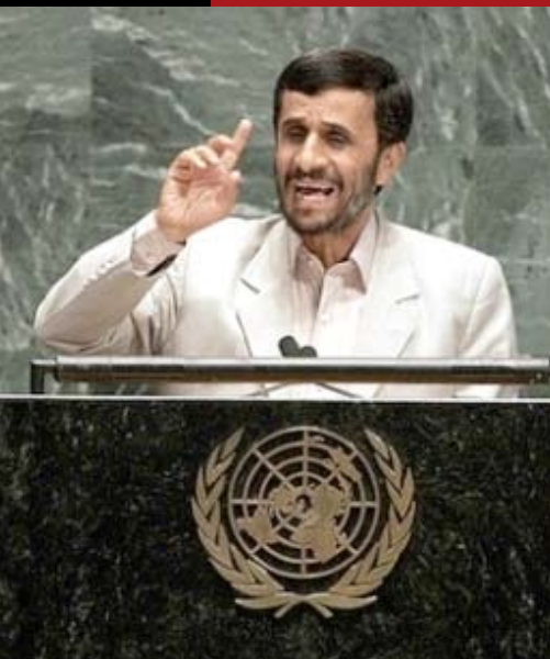
Ahmadinejad at UN

Nuclear Israel not Iran is the greatest threat to peace and stability.