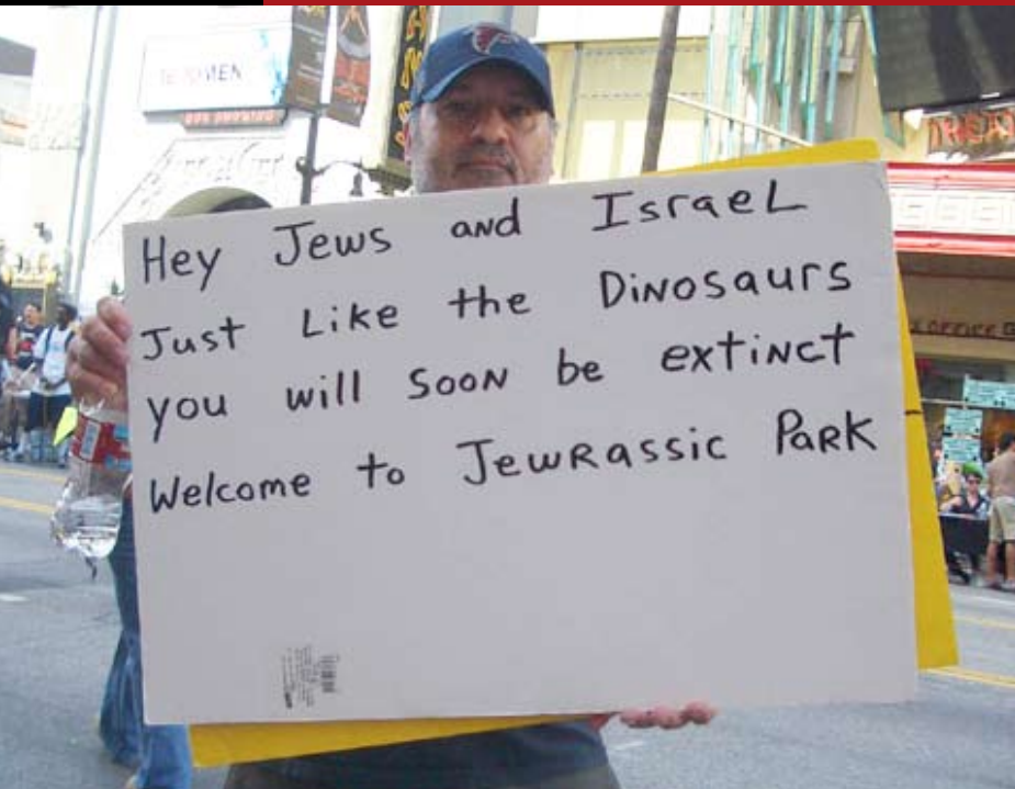
Anti-Israel rally - Los Angeles

The only hope for peace is a single, bi-national state, eliminating the Jewish State of Israel.