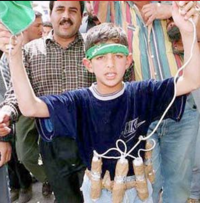
Glorifying Terrorism - Gaza City

Israel is the main stumbling block to achieving a Two-State solution.