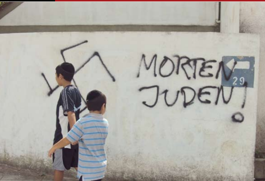
“Death to Jews!” - Argentina

patriarchs and prophets, the Koran also contains virulent anti-Semitic stereotypes that are widely invoked by Islamist extremists, including Hezbollah (whose agents blew up the Jewish Community Center in Buenos Aires in 1994), to justify murdering Jews worldwide. The disappearance of Israel would only further embolden violent Jew-haters everywhere.