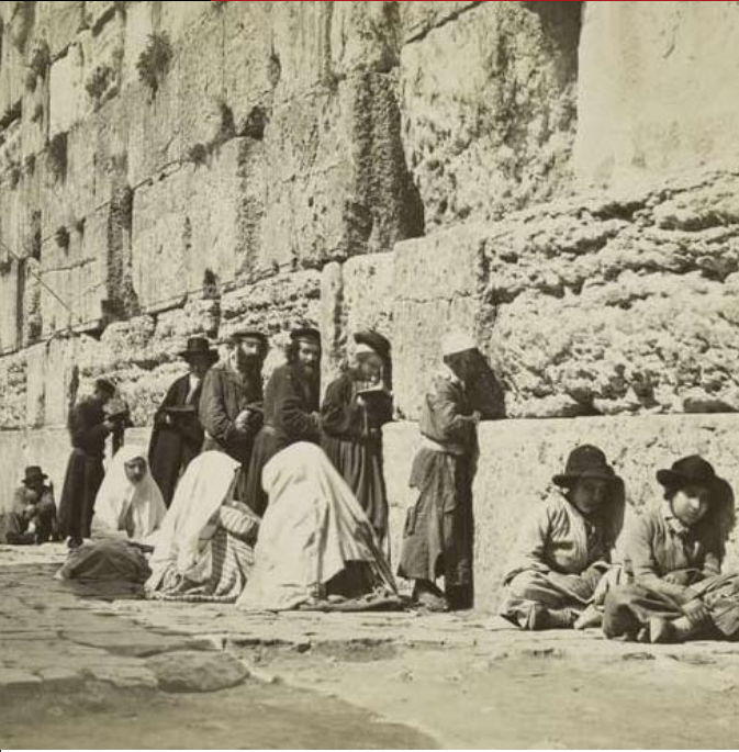
Western Wall - Jerusalem

Israel was created by European guilt over the Nazi Holocaust. Why should Palestinians pay the price?