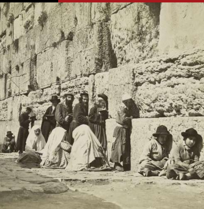
Western Wall - Jerusalem

Israel was created by European guilt over the Nazi Holocaust. Why should Palestinians pay the price?